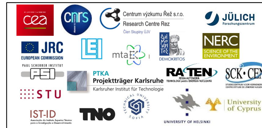
19 nationally funded Research Entities Working on the RWM challenges under the responsibility of MS