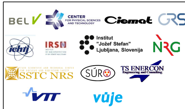
13 regulatory Technical Support Organisations Providing S/T basis for supporting regulators' decisions