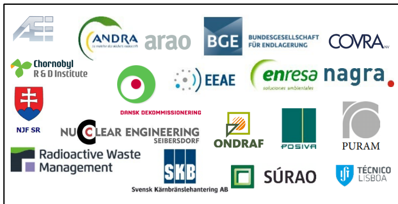
19 Waste Management Organisations Whose mission covers the management and disposal of radioactive waste